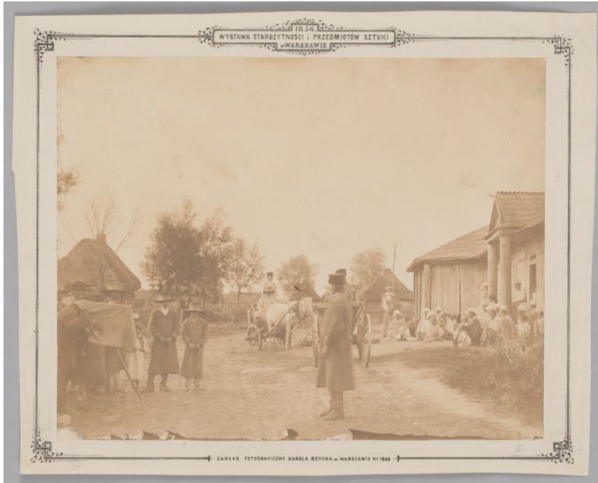
Fig. 1 Marcin Olszyński, photography scene, Starogród village, 1856, salted paper print, cardboard, Muzeum of Warsaw (AF 16655)