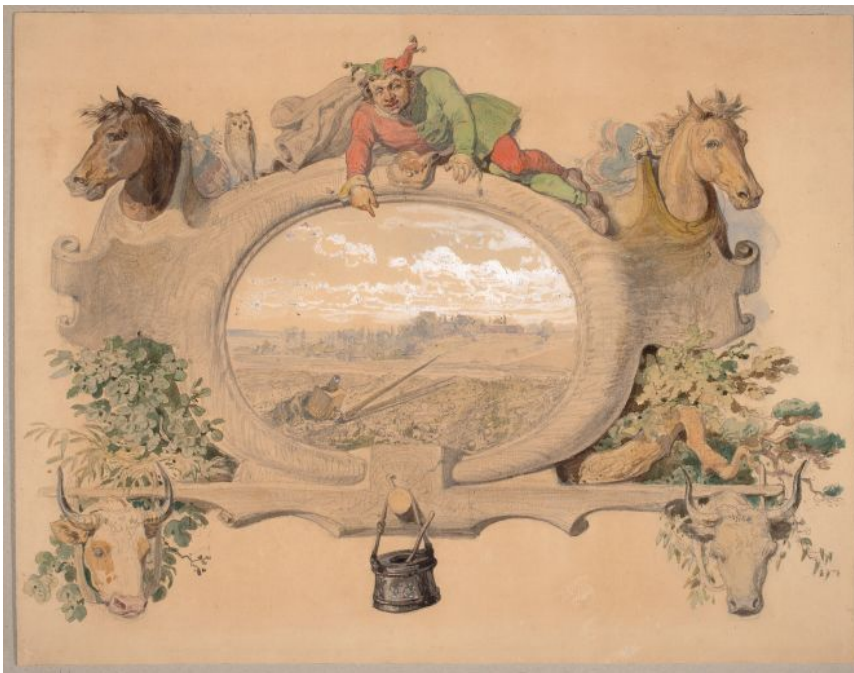
Fig. 13. Wojciech Gerson, Composition with a camera , watercolour, gouache, pencil, National Museum in Warsaw (Rys.Pol.13611 MNW)

collecting supporting material for larger projects. The positive reception of Olszyński's albums at the Resursa Obywatelska Palace in early 1856 also played a role. The idea for the album may have come directly from Beyer himself, who worked on a similar collection for the antiquities exhibition at that time. Olszyński must have recognized photography's supplementary potential in the publishing industry, although the first illustrated magazine in Polish territories would only appear in 1859. 52