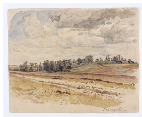
Fig. 14. Wojciech Gerson, Starogród, 1853, watercolour, National Museum in Lublin (S/G/1357/ML)

The Starogród photographic series seemingly resists unambiguous interpretations. It comprises not only the first