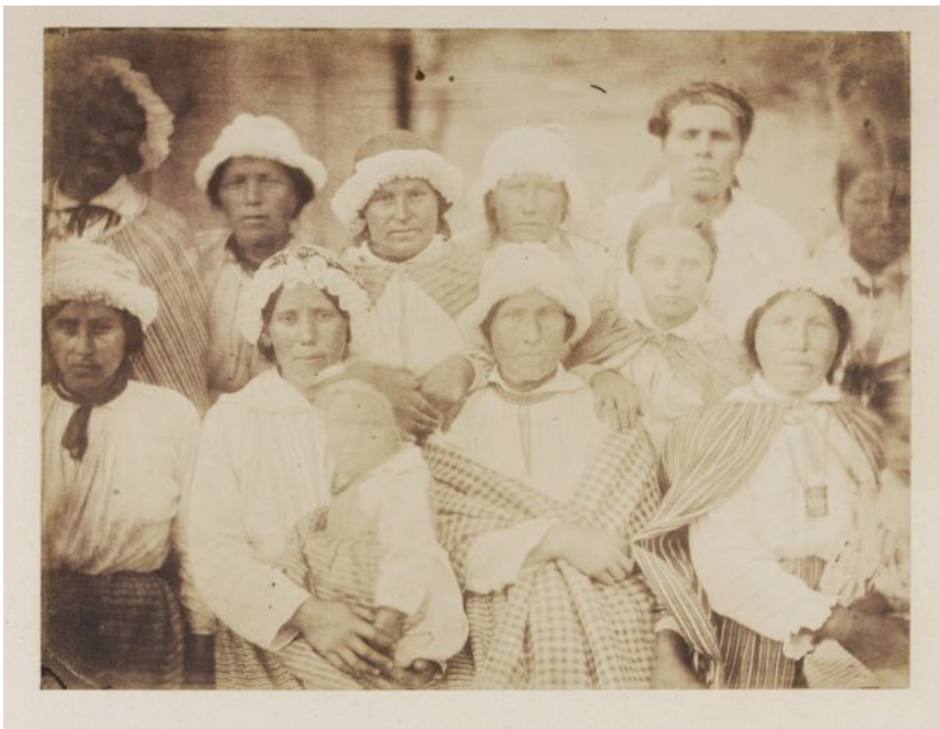
Fig. 3. Marcin Olszyński, Peasant women, Starogród, 1856, copy on salt paper, cardboard, National Museum in Warsaw (Gr.Pol.16288 MNW);

picture recalls a model's head study, the type of exercise students in art schools perform as drawings or using other techniques. Thus, Olszyński borrows from the artistic language of preparatory material, produces photographic notes and sketches, and breaks with the tradition of the studio portrait, which typically assumed a specific pose and a wider presentation of the model. This way, he rejects the photographic canon of the time, which followed the conventions of painting to create supporting material for painters. Such an approach brings him closer to the contemporary understanding of documentary photography. Olszyński produced three more group portraits: of women (Figure 5), of children (Figure 6), and of men (Figure 7). This fact raises the question: why did he choose this particular man?