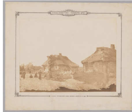
Fig. 11. Marcin Olszyński, Sunday in the countryside, 1856, salt paper print, cardboard, Museum of Warsaw (AF 16654);

What most likely inspired the series of photographs taken in the Polish countryside, were the walking tours across the country, in which Olszyński participated with a group of artist friends. The painters sketched landscapes and folk motifs,