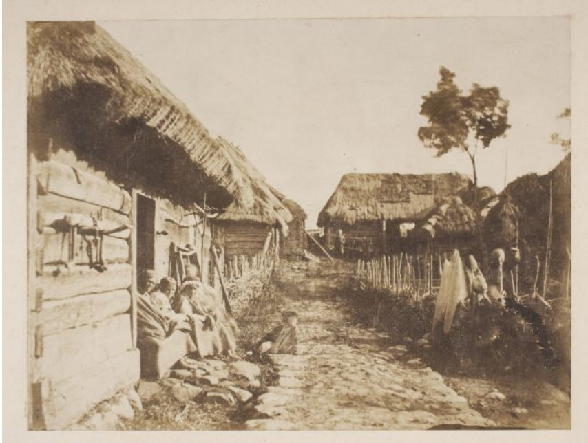
Fig. 8. Marcin Olszyński, Farmstead, Starogród, 1856, copy on salt paper, cardboard National Museum in Warsaw (Gr.Pol.16292 MNW)

tackled the most difficult task: capturing subjects that could move. And even if he did not give us perfect images, they are ours, so much so that one cannot stop looking at them. 43