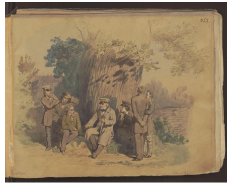
Fig. 6. Wojciech Gerson, Old Man Narrating , c. 1855, watercolour, pencil, National Museum in Warsaw (Rys.Pol.569/11 MNW)