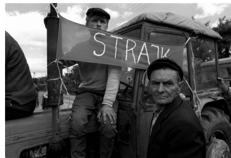
Road blockade in Mława, June 15, 1990, photo: Sławomir Sierzputowski / Agencja Wyborcza.pl

On June 12, 1990, individual dairy producers began blockading the road network around the city of Mława, including State Road No. 7, the main link between Warsaw and Gdańsk. Doing their best to halt traffic, over 500 protesters demanded payment for milk deliveries made in May and an increase to wholesale purchase prices. They pleaded with Tadeusz Mazowiecki and Lech Wałęsa, whom they "had voted for and supported," 2 to assist in negotiations with the Regional Dairy Cooperative. Three days later, however, the government dismissed their demands and ordered the national Chief of Police to disperse the protesters, authorizing the use of force if necessary. Some alleged that "helicopters with special troops" and "armored personnel carriers" 3 were being deployed to Mława. Others claimed that only the efforts of the local police chief prevented the standoff from descending into violence. 4 Just before the government's ultimatum expired, the farmers suspended the protest, following mediation from none other than the head of "Solidarność," Lech Wałęsa. 5 "Banks of