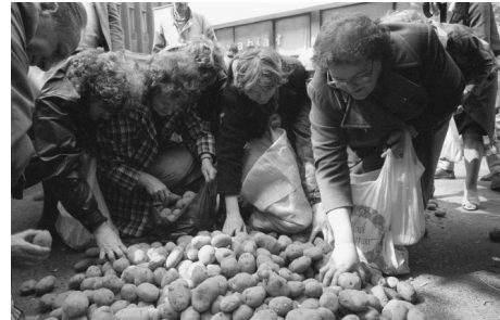
Locals collecting potatoes discarded by farmers, Warsaw, April 26, 1990

Solidarność in the 1980s), 59 was a clear signal that the farmers would abandon the peasant ethos of being "providers for the people" in light of the steep decline in their living and working conditions. The traditionally conceived duty of the peasantry, to supply the cities with food, was called into question. Conflicts between the cities and the countryside focused on food supply naturally predated the post-1989 transition, but it was only then that farmers decided to engage in efforts designed to show city dwellers – government officials above all – just how unprofitable agriculture was becoming. To that end, they pursued gestures deemed shocking – particularly within the context of the peasantry's (either projected or real) veneration of the earth and its crops – and practices intended to win the urban populace over to their cause.