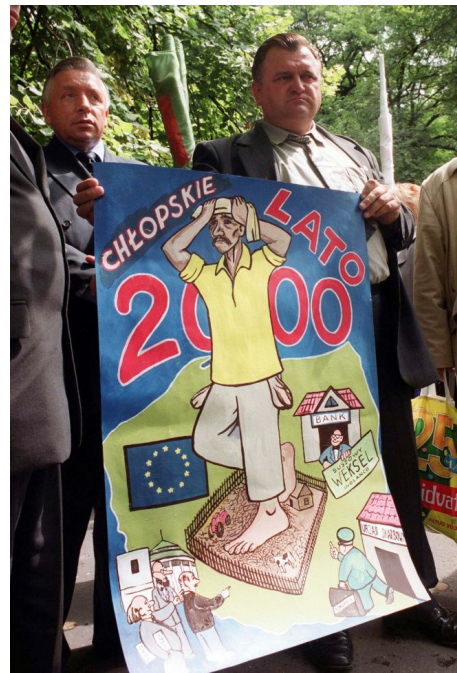
"Peasant summer 2000", demonstration in front of the Prime Minister's office, Warsaw, July 27, 2000, photo: Przemek Wierzchowski, PAP

At the protests, visual accounts of which we are presenting herein, explicitly formulated demands aimed at the government substantially outweighed any visions for potential co-existence and alternative economic systems. However, in the first decade of the post-socialist transition, the economic precepts of