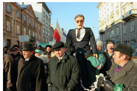
Peasant demonstration in Warsaw, December 3, 1998, photo: Sławomir Kamiński / Agencja Wyborcza.pl

Produced in large quantities by the protesters and routinely subjected to violence, the effigies differed in terms of make and material – ranging from the most realistic-looking, boasting carefully painted papier mâché heads and dressed in a suit, tie, and dress shoes, to sacks covered in fabric with faces drawn in black felt-tip pen, or human shapes cut out of styrofoam. They were either made to resemble specific individuals – Leszek Balcerowicz being the most frequent choice – or left vague enough to represent broadly defined government authorities or "elites." The props were subjected to ritual humiliation – kicked, torn apart, and set on fire – simulating actual violence being meted out to the individuals they represented. The symbolic act provided an outlet for pent-up