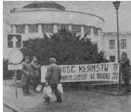
A protest organized by NSZZ "Solidarność" RI, January 11, 1990, "Nowa Wieś" 1990, no. 4

In the end, however, invading the field of visibility proved the most effective method of making their proposals heard. To that end, protesters repeatedly seized government buildings, including the Ministry of Agriculture, voivodeship offices, and city halls. Recordings of the occupations usually look very similar, repeating the same images: dozens or even hundreds of protesters infiltrate the premises, escort the staff out, and then