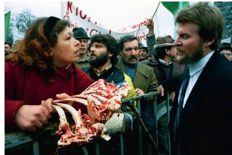
Protest in front of the Parliament building, April 2, 1993

Other "vernacular sculptures" often appearing at demonstrations involved animal remains – heads, ribs, and other bits of carcass. Pig heads were dressed as politicians – first anthropomorphized, then stuck on pikes and painted red. Ribs became banners, carried high over protesters' heads, or