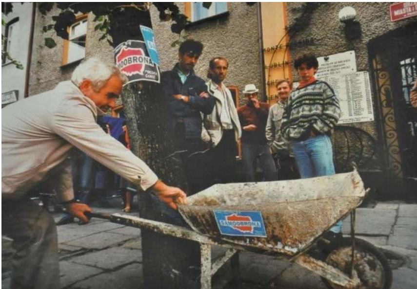
Photo from an article titled "Wheelbarrows again", Miliarder , August 26, 1993

This rhetorical device, typical for Lepper, inverts the direction of the moralizing judgment, turning it back against state institutions and government officials, and is symptomatic of attempts to extend the area of political engagement from just farmers to a much broader group who believed themselves adversely affected by the post-1989 transition. 34 While some scholars interpret this turn as a departure from a "strong class understanding of peasant interests," 35 it might also be seen as an attempt at building class solidarity between farmers and the working class.