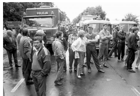
Road blockade in Ołtarzewo near Błonie, July 6, 1992, photo: Kuba Atys / Agencja Wyborcza.pl

Perhaps the most spectacular of all protest tactics employed throughout the transition-era farmers' protests was the coordinated road blockade, like the ones that brought the country to a standstill on July 11, 1990, and halted traffic at the Świecko border crossing on the night of January 21–22, 1999. At its heart, a blockade is an attack on the core capitalist value of the free movement of goods. In 1999, Andrzej Lepper regularly called on farmers to "block border crossings to prevent the import of cheap foodstuffs and crops into Poland." 43 The resulting traffic jams slowed the notorious 1990s lorry traffic to a near-standstill. Transition-era Poland, however, relied on its road network for more than just the transport of goods – in the '90s, Poles began choosing cars over public transport for their daily commutes, weekend trips