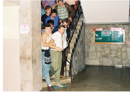
Protest in Praszka, August 1993

In August 1993, Samoobrona activists lent their support to the striking people of Praszka, a city in the Opole voivodeship, where downsizing at the Polmo automotive plant had resulted in the dismissal of a large portion of its workforce. 31 At one point,