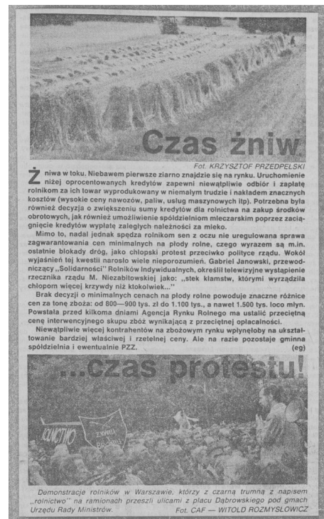
"Time of harvest - time of protest". "Chłopska Droga", July 22, 1990

In the early 1990s, the median per capita income in farmer households dropped off sharply, severely limiting their purchasing power. 25 Their fight, therefore, was for debt relief and writing off, access to low-percentage loans, the possibility for worker cooperatives to buy out SAF properties, unemployment benefits for farm workers, and – likely shocking neoliberal ideologues to their core – minimum prices for wholesale crop and livestock purchases. This "privilege of real socialism," to quote Edmund Mokrzycki, which the farmers were struggling to recapture for themselves, was the measure of certainty that came from the belief that everyone playing the