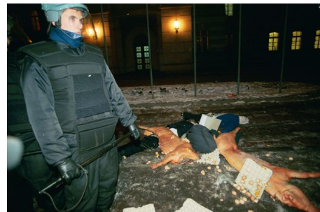
Farmer protest in Warsaw, December 3, 1998, photo: Sławomir Kamiński / Agencja Wyborcza.pl

Paradoxically, both spoilage and the free distribution of food were intended to illustrate the crux of the problems afflicting the Polish countryside: the staggering unprofitability of almost all agricultural production in the early 1990s and specific crops later in the decade. One popular complaint among farmers was that the cost of production significantly outweighed the profit expected from future sales. Sometimes, crops were spoiled while still in the fields: "Many farmers take a cost-benefit approach and, seeing the outcome, simply raze their crops, whether with machines or fire. The cost calculations