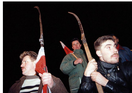
Blockade of the border in Świecko, January 1999, photo: Sławomir Sajkowski / Agencja Wyborcza.pl

In a cartoon published in Nowa Wieś under an article about the first national Samoobrona convention, a group of farmers, painted in homogenous, stereotypical strokes – with broad backs, pant legs stuffed into their valenki [winter boots], flat caps, and scythes with blades fixed like bayonets – gather