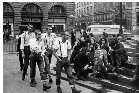
Figure 2: Herrador de Zapatos, London Skinheads. Source

The skinheads' subculture emerged from that of the mods, but their other main source of inspiration was the presence of West Indian immigrants in working-class English neighborhoods, who had imported ska and rocksteady music, and with them the "rude boy" style. 19 In retrospect, it might appear paradoxical that the early skinheads were inspired by an essentially black youth culture such as ska, especially as, during the 1970s, many skinheads would develop racist and nationalist sympathies. That the fundamentally multicultural phenomenon of the "alliance" between working-class skinheads and West Indian rude boys could be reversed can be explained by the fact that the presence of migrant youth cultures in England, apart from providing a source of inspiration, was also the clearest visible evidence of changing British society, and as