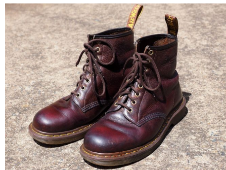
Figure 1: A pair of well worn brown Dr Martens 1460 boots.

Within these subcultures in their original English forms, Dr. Martens furthermore signified rebelliousness and working-classness. These codes and subcultural references perhaps resonate only faintly for today's lovers of Dr. Martens. Therefore, from the context of that subcultural background, the present times can be confusing. Today, Dr. Martens are worn by college students from all sorts of backgrounds, with all sorts of taste preferences and beliefs. Young children even wear them. 2