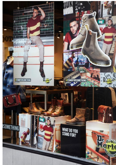
Figure 4: ODD London, #standforsomething campaign, 2014.

This also allows for the argument that the references connected to Dr. Martens as a commodity, such as working-classness, individuality, skinhead, punk, or LGBTQ+, which stand for something, can commoditize too. Regardless of the buyer's social position, taste preferences, sex, or gender, the reference to working-classness or to a specific subculture or attitude becomes exchangeable. It can even be argued that such references, aside from having an intrinsic value, now also have a use value as a commodity to the extent that, through acquiring Dr. Martens, a person can also literally buy an image that they