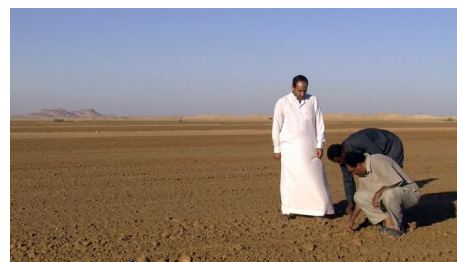
Fig. 7. Ursula Biemann, Egyptian Chemistry , 2012.

Aiming to undermine the utilitarian-anthropocentric perspective through which elements like water and soil are usually viewed, Egyptian Chemistry engages with methodologies of new materialism, speculative realism philosophy and chemistry, “demonstrating an aesthetic sensitivity to the agency of objects” 91 entangled with human systems in unexpected ways. This is clearly seen in her annotated