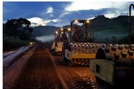
Fig. 2. Uwe H. Martin & Frauke Huber, LandRush - The Farm , Ethiopia, 2011-ongoing. Video and photograph. ©Uwe H. Martin & Frauke Huber

Placing Brazil in an international comparative perspective, the videos also track farming developments in Ethiopia ( LandRush-The Farm ), where the use of chemical pesticides by commercial farms has fouled traditional farming lands, thus forecasting the depletion of clean water supplies. Through the use of ethnographic models and documentary practices, the project explicates how outsourcing food production is becoming a global trend. "Farmland is today's hottest investment, triggering a genuine land rush." 65 While for the local rural population self-sustainability comes first, the city of Gambela depends on the production of surplus food in the countryside. Ethiopian farmers have been pushed aside by ambitious large-scale foreign investors, supporting the country's move to high-tech farming and corporate enclosure of land. LandRush-The Farm depicts how international land investments in Ethiopia are altering the social and environmental fabric of the Gambela