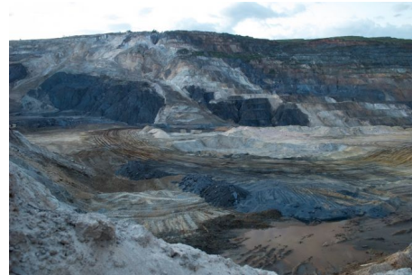
Fig. 5. Mabe Bethônico, Mineral Invisibility , 2008–ongoing.

In an effort to raise critical awareness and foster discussion on the environmental impact of the mining industry and on the need for workers' rights and gender equality, Mineral Invisibility brings together documentary films, photographic material, publications, essays and posters to