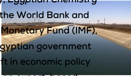
Fig. 6. Ursula Biemann, Egyptian Chemistry , 2012. ©World of Matter

Additionally, Egyptian Chemistry exposes how the World Bank and International Monetary Fund (IMF), steered the Egyptian government towards a shift in economic policy by promoting an export-based agro-industrial economy