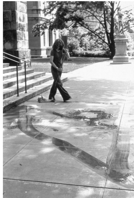
Mierle Laderman Ukeles, Hartford Wash: Washing, Tracks, Maintenance: Outside , 1973.

A key component of the work is its unsettling of the valorization of labor power, particularly evident in Transfer: The Maintenance of the Art Object (1973). In this part of the durational work, Ukeles suggests – in a detailed chart – the arbitrariness in distinctions of use and exchange value in work performed by a “maintenance person,” a “maintenance artist,” and a museum conservator. She chose to “maintain” a glass case that housed a female mummy, on loan from the Metropolitan Museum of Art. 53 Since she cleaned the case as a “maintenance artist,” as opposed to a maintenance worker (museum cleaning staff or the like), the “dust painting” she created became a work of art – a playful invocation of the Duchampian adage: it is art if the artist “says it is,” or if it enters the institutional site of display. Her intervention was then codified as an artwork via her