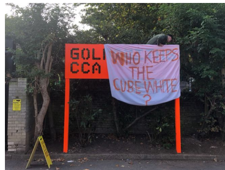
Photograph of an action by Justice for Cleaners-Goldsmiths at the inaugural exhibition of the Goldsmiths Centre for Contemporary Art (CCA), September 6, 2018.

One potential example is the powerful slogan mounted by protesting students at the opening of the Goldsmiths Centre for Contemporary Art in September 2018, which illustrates the struggles referenced here with elegant economy: "Who keeps the cube white?" 8 The protests were organized outside the inaugural exhibition of work by Mika Rottenberg, as a call