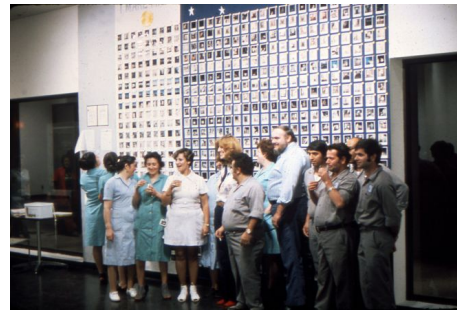
Mierle Laderman Ukeles, I Make Maintenance Art for one Hour Every Day, 1976.

As a precursor, Autonomia (alternatively operaismo [workerism]) had developed in Italy during the late 1960s through a resurgence of factory workers' struggles, which led to radical re-readings of Marxist orthodoxy, particularly a rejection of the Stalinist Marxism still prominent in the Italian Communist Party. They adjusted Marxian frameworks to allow for the critique of all institutions – from the party to the state, from the union to the political movement itself – most prominently in the writings of Negri, Mario Tronti, and Paolo Virno. However, at the beginning, this group was often antagonistic to feminism and to women members themselves. An infamous event occurred in Rome in 1977 when "the male stewards of Lotta Continua and of the Comitato Autonomo di Centrocelle attacked a feminist demonstration and its vindication of a woman's right to separate from a man." 59 Such inconsistencies clearly prompted writers and activists to develop more-inclusive frameworks; writers as