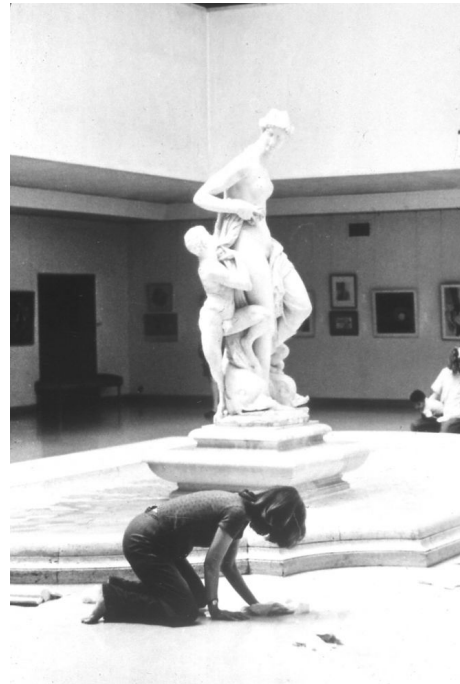
Mierle Laderman Ukeles, Hartford Wash: Washing, Tracks, Maintenance: Inside , 1973.

When the exhibition travelled to the Wadsworth Atheneum in Hartford, Ukeles proposed to perform her maintenance art, and the museum agreed. She famously scrubbed the floors outside and inside the museum ( Hartford Wash: Washing, Tracks, Maintenance: Outside and Hartford Wash: Washing, Tracks, Maintenance: Inside – the former a now-iconic image), washed the glass cases of a mummy ( Transfer: The Maintenance of the Art Object ), and locked and unlocked gallery/office doors ( The Keeping of the Keys