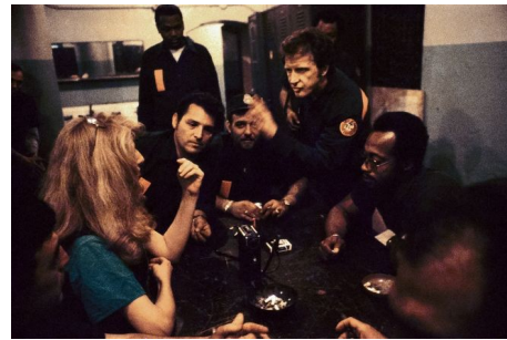
Mierle Laderman Ukeles, Touch Sanitation , 1979–1980.

Speaking about the need for a larger feminist movement that leaves the home, Federici remarks: "Women have always found ways of fighting back, or getting back at them, but always in an isolated and privatized way. The problem, then, becomes how to bring this struggle out of the kitchen and the bedroom and into the streets." Ukeles, after she brought the maintenance of the home into her art, and that maintenance art into the corporate space and museum, continued with taking her art to the "streets," or more appropriately to the municipal system, with its garbage trucks, landfills, and depots.