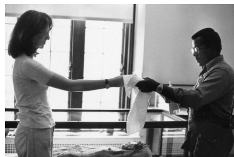
Mierle Laderman Ukeles, Transfer: The Maintenance of the Art Object , 1973.

Vishmidt again: "In proposing a world in which 'maintenance' activities were just as legitimately a part of the art as the objects or even the more ephemeral propositions or documentations that announced conceptual art, she was suspending the division of symbolic and physical labour that ensured work and art