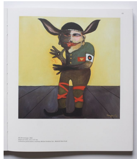
Maryan, Personnage 1962 oil on canvas

After he was refused French citizenship, he traveled to the United States with his wife on a boat called the Leonardo da Vinci (!) in the year of the Cuban Missile Crisis and Algeria's proclamation of independence. He went to France at the age of 23 in the midst of the Indochina War, from Israel/Palestine where, after being admitted to the Bezalel Art Academy in Jerusalem, he had survived the War of Independence and the siege of the city. Maryan left Poland to seek refuge in Germany in 1946 having witnessed a growing wave of postwar antisemitism. In 1944, he was sent to Auschwitz and – as inmate A17986 – worked in Gleiwitz. Between 1942 and 1943, he lived in the Rzeszów ghetto. On the night of his arrival, together with 22 other Jews, he was chosen to be executed. Shot twice in the face and once in the neck, he was found alive among the corpses. Pinchas Burstein (Bursztyn), was born – or so he claimed – on January 1 st 1927 in Nowy Sącz.