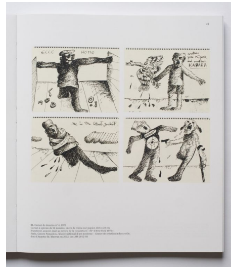
Maryan, Notebook 4, 1971

The film alludes to the poetics of experimental cinema: it is a series of staged recollections where photographic images and reproductions of Maryan's paintings, drawings, and lithographs alternate with a disturbing performance. Maryan reenacts Holocaust memories with the use of numerous accessories such as an M16 gun, dummies of SS officers, a straitjacket, ropes, and paint. The film opens with the following sequences of images appearing one after another: the Virgin Mary, women in robes during a Ku-Klux-Klan ceremony, Maryan himself in a black dress resembling a cassock with his arms stretched wide (as if crucified), Yasser Arafat, the Pope on a stool, images of crucifixion, a black cloth with a white swastika on it, black crosses on the white robes of Ku-Klux-Klan members, the shooting of Maryan as a Nazi, black tape covers his eyes and mouth, then pictures of Pinochet, Napoleon, Maximilian Kolbe (with the camp number 214510672 on his chest), piles of corpses from the My Lei massacre, Christ in a crown of thorns covered in paint. Religious motifs, iconic images of historical events and people, press clips